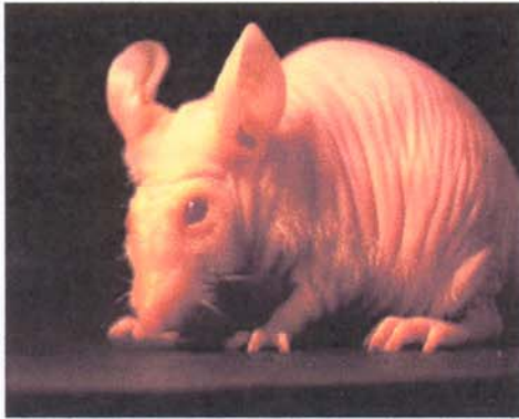
Under natural light